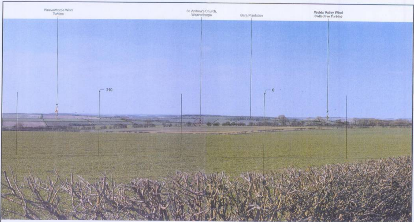
Vertical guidelines are at intervals of 10', numbers at 20', where 0' is Grid North.

2012-2013-Weaverthorpe-WWC-Fig21-VP31.cdr