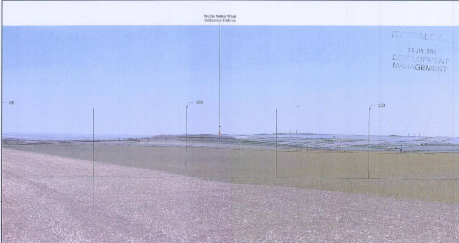
Vertical guidelines are at intervals of 10°, numbers at 20°, where 0° is Grid North.

RYDALE 30 JUL 2013 DEVELOPMENT MANAGEMENT