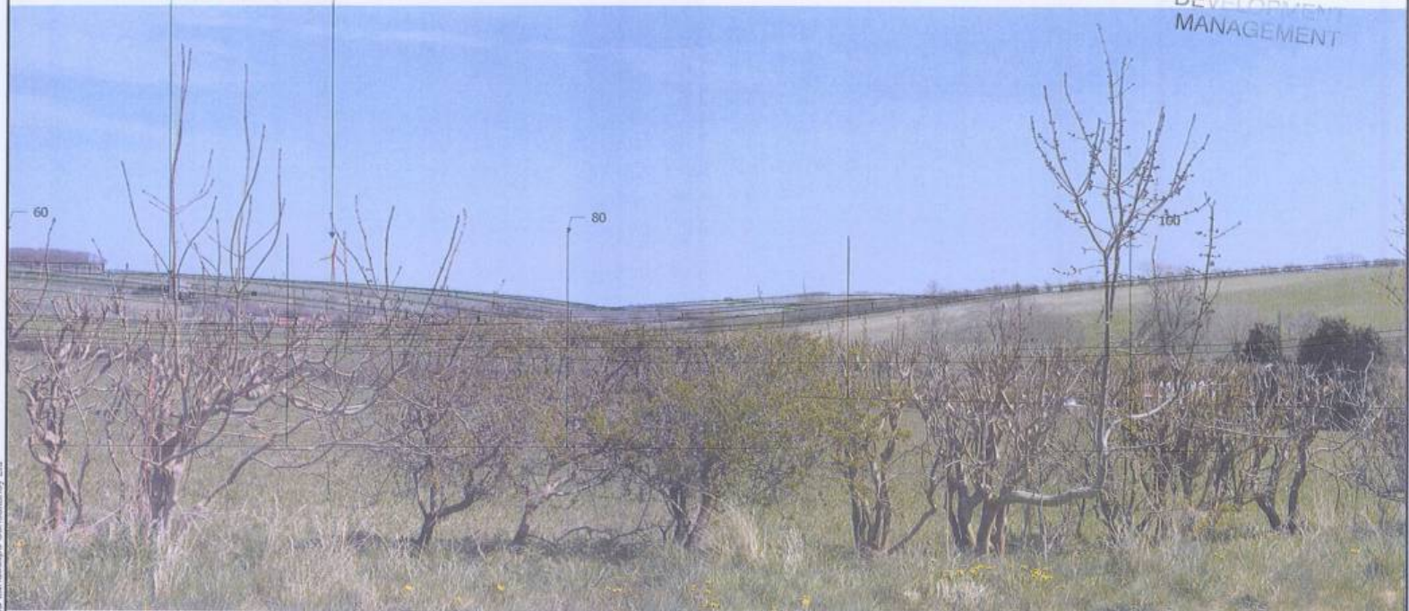
Vertical guidelines are at intervals of 10°, numbers at 20°, where 0° is Grid North.

St. Andrew's Church, Weaverthorpe Wolds Valley Wind Collective Turbine