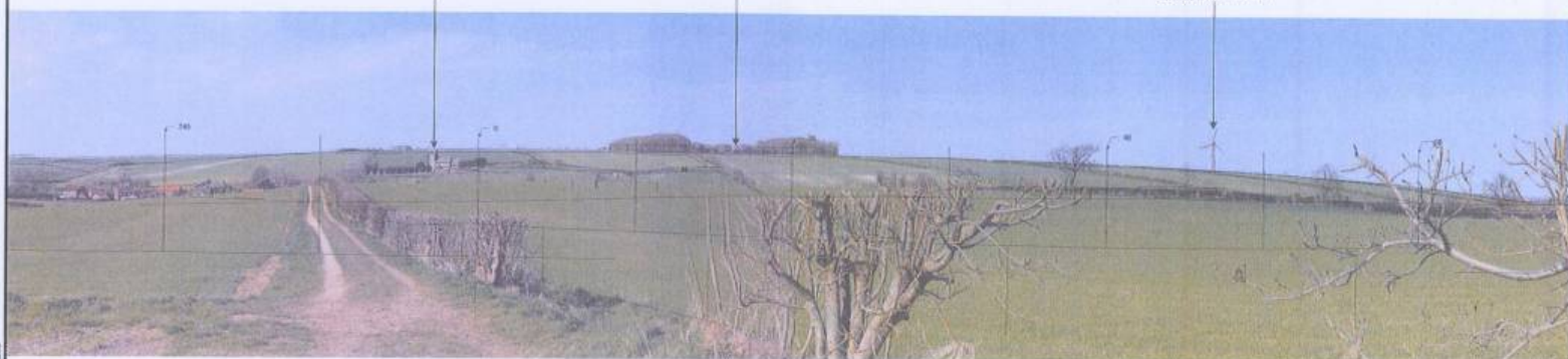
Vertical gridlines are at intervals of 10°, numbers at 20°, where 0° is Grid North.

THIS COPY HAS BEEN MADE BY OR WITH THE AUTHORITY OF WESTYORKS DISTRICT COUNCIL PURSUANT TO SECTION 41 OF THE COPYRIGHT DESIGN AND PATENTS ACT 1988. UNLESS THAT ACT PROVIDES A TECHNICAL EXCEPTION TO COPYRIGHT, THIS COPY MUST NOT BE COPIED WITHOUT THE PRIOR PERMISSION OF THE COPYRIGHT OWNER.