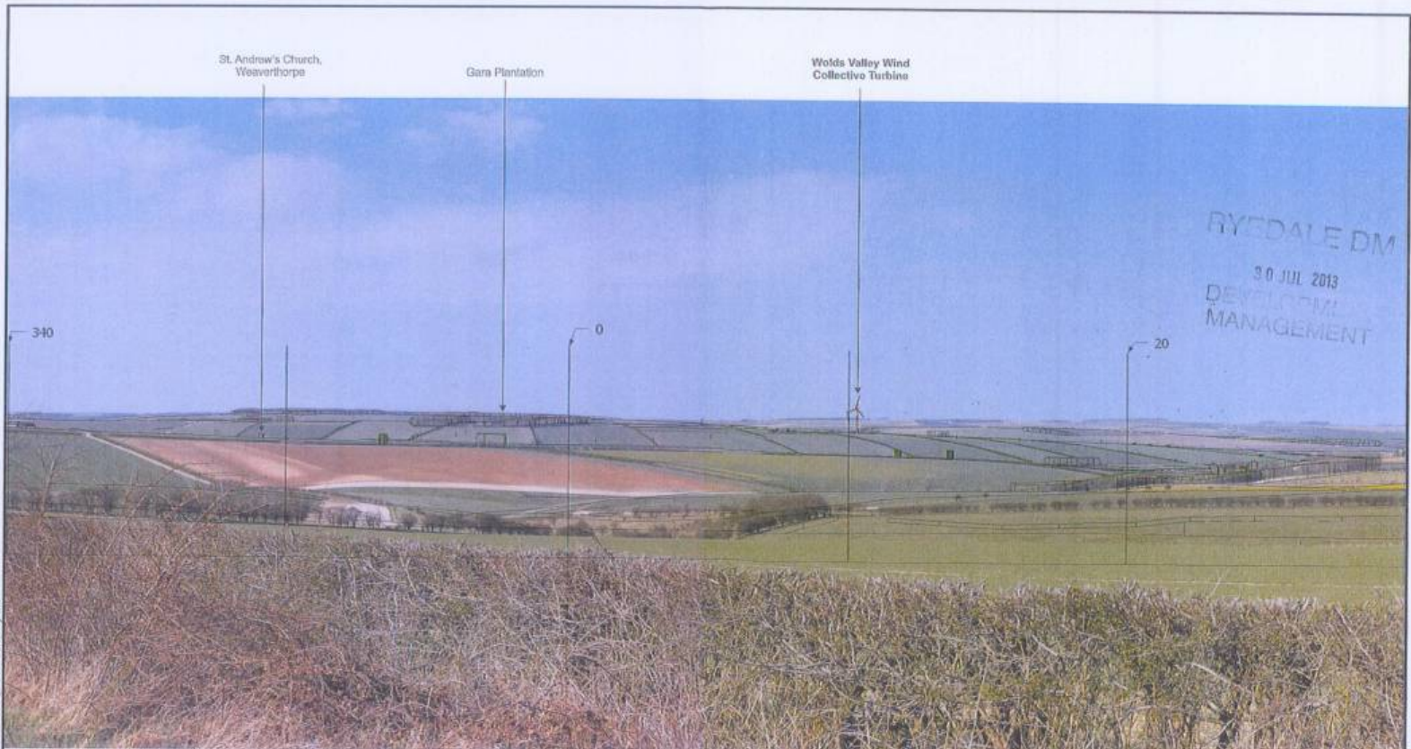
Vertical guidelines are at intervals of 10°, numbers at 20°, where 0° is Grid North.

THIS COPY HAS BEEN MADE BY OR WITH THE AUTHORITY OF RYEDALE DISTRICT COUNCIL PURSUANT TO SECTION 57 OF THE COPYRIGHT, DESIGN AND PATENTS ACT 1988 UNLESS OTHERWISE STATED. NO LIABILITY IS ACCEPTED FOR ANY LOSS OR DAMAGE CAUSED BY THE USE OF THIS COPY. THIS COPY MUST NOT BE COPIED WITHOUT THE WRITTEN PERMISSION OF THE COPYRIGHT OWNER.