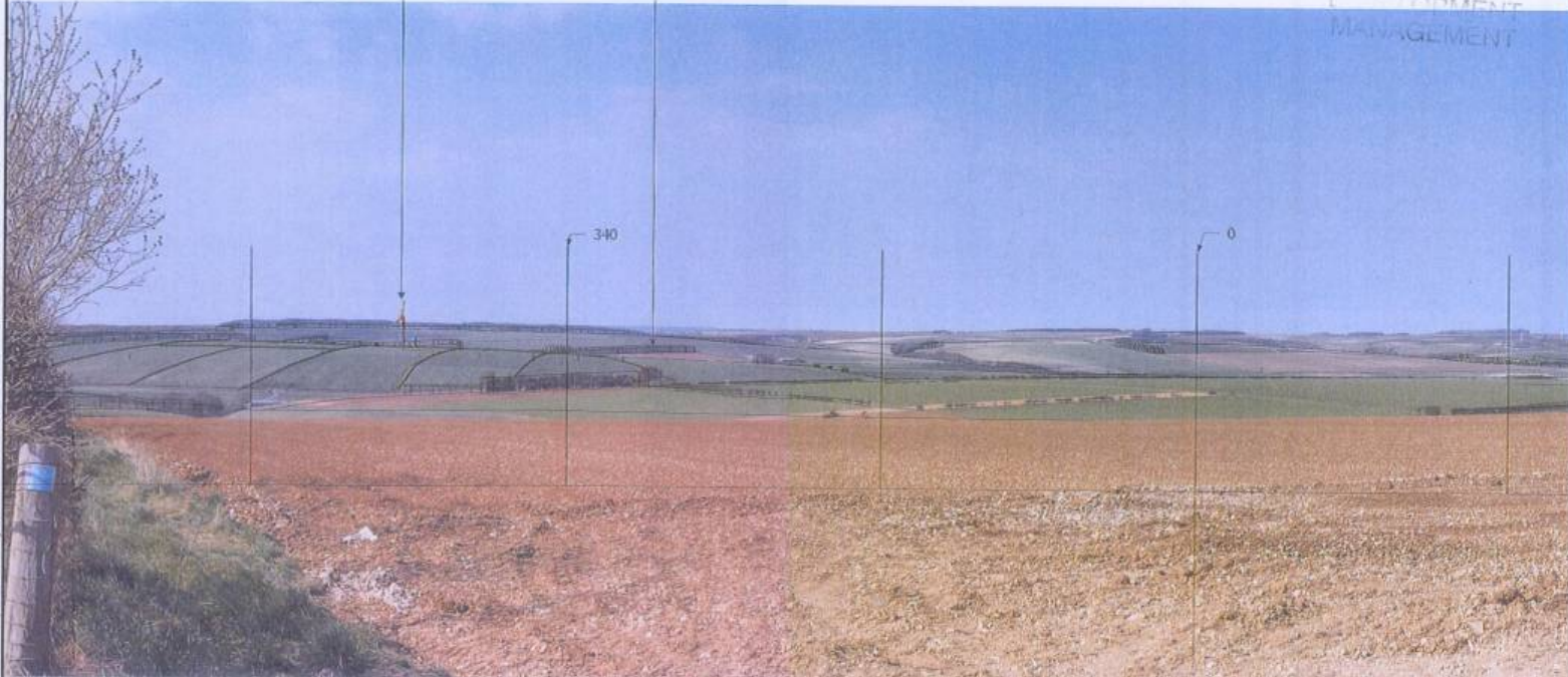
Vertical gridlines are at intervals of 10°, numbers at 20°, where 0° is Odd North.

THIS COPY HAS BEEN MADE BY OR WITH THE AUTHORITY OF RYEDALE DISTRICT COUNCIL PURSUANT TO SECTION 47 OF THE COPYRIGHT, DESIGN AND PATENTS ACT 1988. UNLESS THAT ACT PROVIDES A SPECIFIC EXCEPTION TO COPYRIGHT, THE COPY MUST NOT BE COPIED WITHOUT THE PRIOR PERMISSION OF THE COPYRIGHT OWNER.