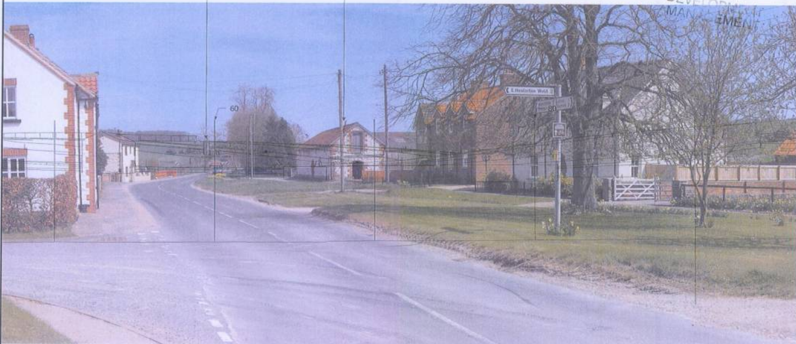
Vertical guidelines are at intervals of 10°, numbers at 20°, where 0° is Grid North.

St. Andrew's Church, Weaverthorpe Wolds Valley Wind Collective Turbine